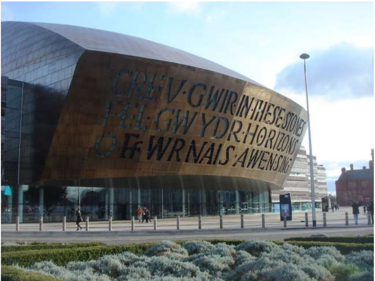
Figure 6 Wales Millennium Centre

unprecedented building it has succeeded in showcasing the contemporary metropolitan culture of Wales (figure 6).