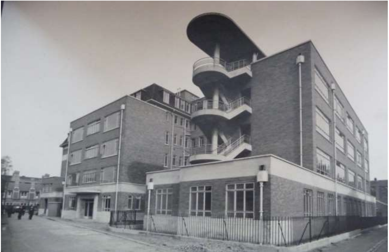
Figure 3 Cardiff Maternity Hospital

was built using innovatory design concepts: 'this is the first bridge in the world to use the revolutionary concept of the streamlined deck and inclined hangars' (English Heritage List Description). Thomas designed the towers, piers and anchorages. Crucially for Wales this bridge facilitated greatly improved access to commercial markets, London and European ports and became a potent symbol of the 'New Wales'.