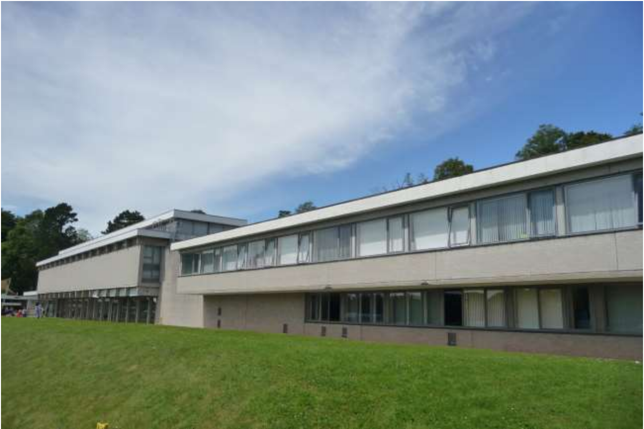
Figure 7 Main Building, Welsh Folk Museum

changing - but ever-contested - administrative arrangements for Welsh affairs (Davey, 2014, chapter 6). This paper will not delve into these aspects, but will simply consider the influence of the architects over the design of the building, and the way that this reflected their own commitments to expressions of Welsh nationhood.