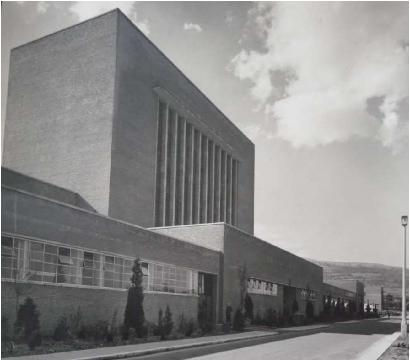
Figure 2 British Nylon Spinners, Pontypool 1945

An important commission for Thomas's practice in the Development Area of south Wales was the factory for British Nylon Spinners at Pontypool in 1945. It was the sole source of all the nylon yarns produced in Britain. The factory is considered to be 'a pioneering example of industrial architecture applied to a pioneering industry' and a 'centre-piece of post-war reconstruction' (Cadw List Description) and was acclaimed at the time of its completion as one of the finest examples of modern industrial architecture (figure 2).