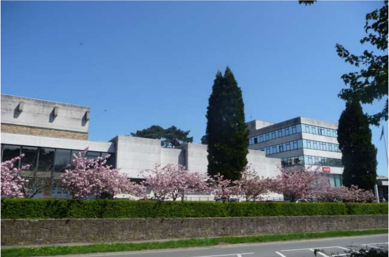
Figure 4 Broadcasting House, BBC, Cardiff

For the remainder of the twentieth century the steadily growing practice continued to work on projects in Wales which signified a nation emerging to find its place in a world of nations, some of which would be independent states and others not . By the late 1970s there were approximately 140 professional and technical staff and 40 administrative staff in the practice with two of the major Groups based in Cardiff office, which still housed the Central Administration and Computer Aided Design Centre, and nine partners including the Company Secretary.