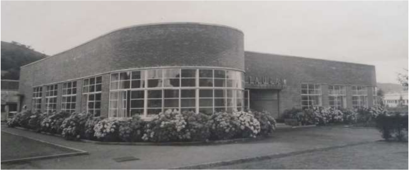
Figure 1 Treforest Trading Estate 1936

It was Thomas, for example, who acted as Honorary Architect to the Wales and Monmouthshire Industrial Estates Ltd., developers of Treforest Trading Estate in the 1930s (figure 1). The sixty factories designed by Thomas were mostly to a standard pattern, but the whole initiative received UK wide recognition as an example of the modernising of the economy, and nation (Short et al, 2003).